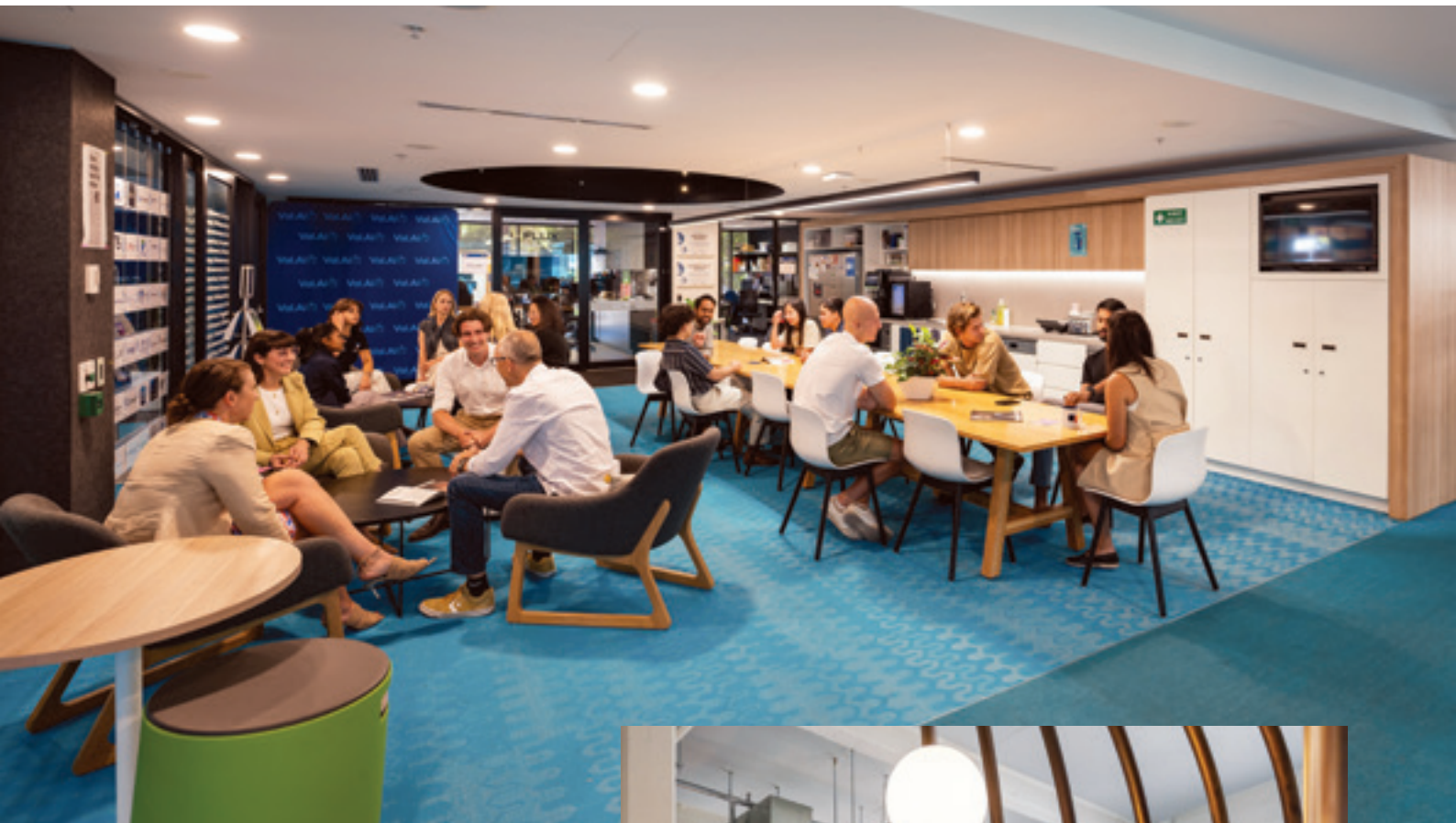
ThincLab, Adelaide City Campus - East