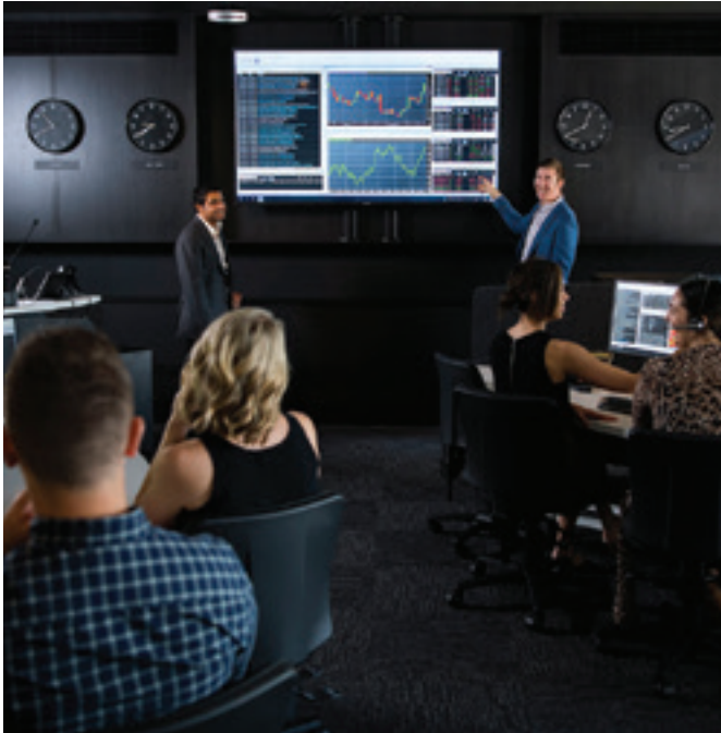
Iress Trading Room, Adelaide City Campus - West