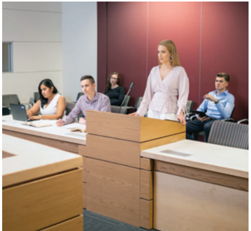
Moot Court, Adelaide City Campus

Level up your debating, advocacy, and mediation skills through participating in moot court experiences. You'll learn to argue a case, how to act as an advocate and gain experience presenting before a judge. Designed to look and operate just like a real courtroom, our moot court will provide you with opportunities to develop your practical legal skills and knowledge in a supportive environment.