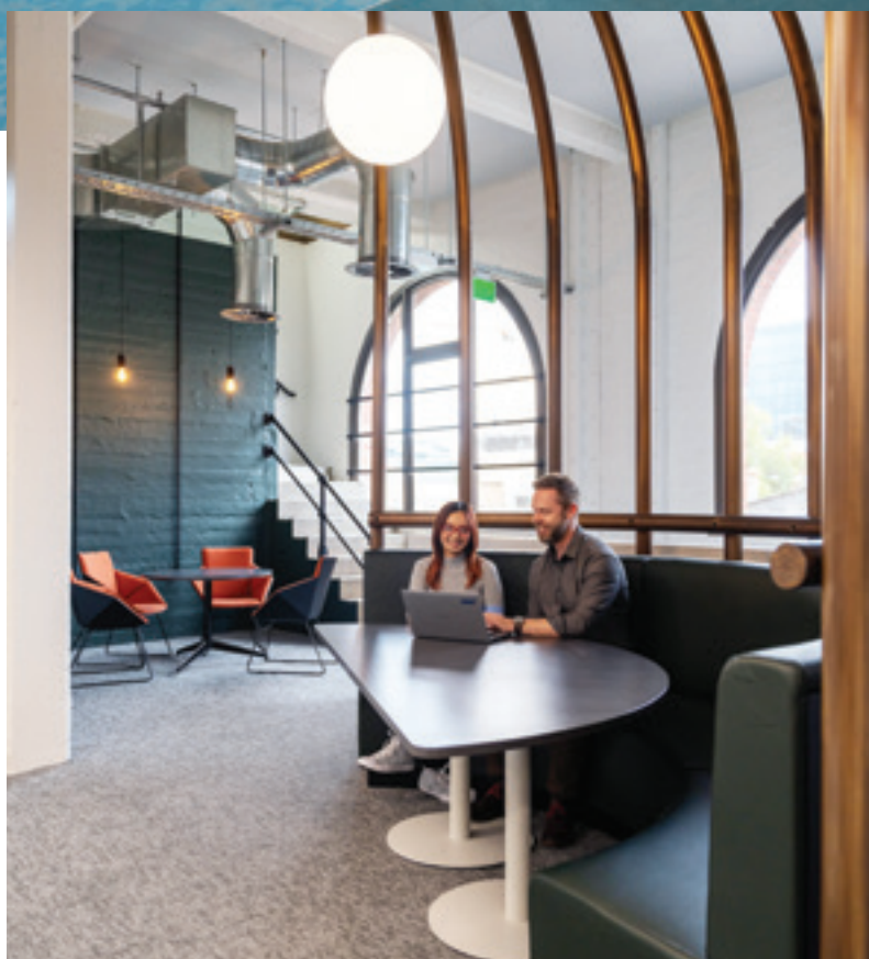
Enterprise Hub, Adelaide City Campus - West

Adelaide University is home to a range of entrepreneurial hubs where big ideas are nurtured. Immerse yourself in modern, well-appointed facilities where entrepreneurial and innovative minds converge. The world-class ThincLab on North Terrace provides a supportive start-up environment with opportunities to create, develop and action ideas. In the west-end, the world-leading Ehrenberg-Bass is home to marketing science experts that advise global brands such as Colgate-Palmolive, Mondelez International and Nestlé.